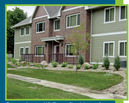
Quad-Multi Family Housing