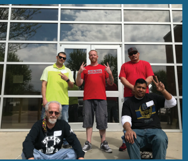
Our guests learning to give back by volunteering at the Banquet during the pandemic