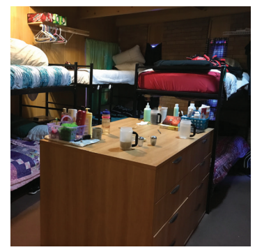
At present, ten women are bunked in a single 20' by 15' room in the main house.