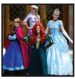
A Princess Party