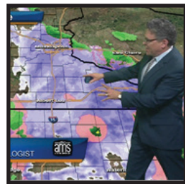
Weatherman for a Day