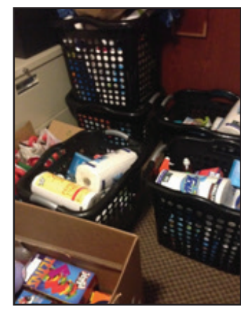
by sharing your personal