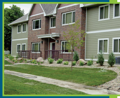
Quad-Multi Family Housing