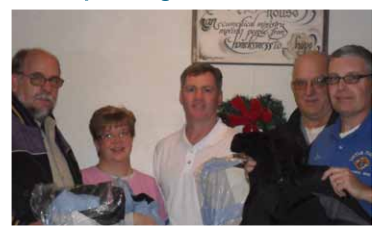
Knight of Columbus donating coats for the our children