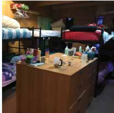
At present, ten women are bunked in a single 20' by 15' room in the main house.