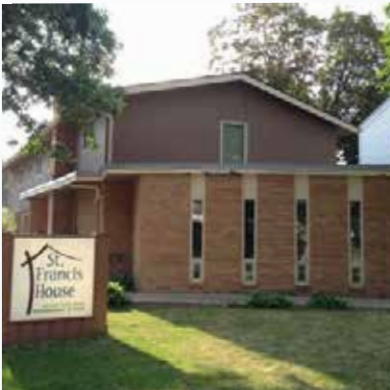
The current St. Francis House was formerly a convent. Built in 1956 for 12 sisters, it now houses 22 men and 30 women.