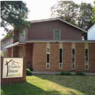
The current St. Francis House was formerly a convent. Built in 1956 for 12 sisters, it now houses 22 men and 30 women.