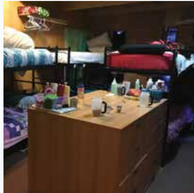
At present, ten women are bunked in a single 20' by 15' room in the main house.