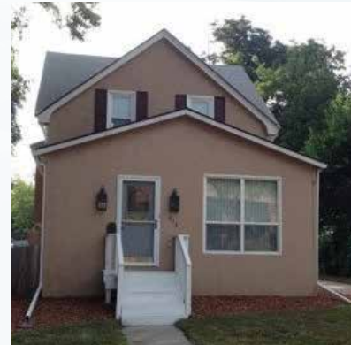
In November 2014, we purchased the Sherman House. This allowed us to serve an additional nine men.