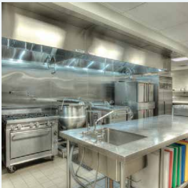
The Kitchen. We frequently receive donations of food and other goods. Nothing is wasted. Anything beyond our need is shared with other area providers.